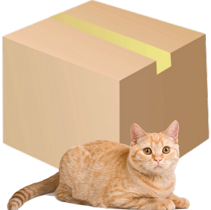
in front of